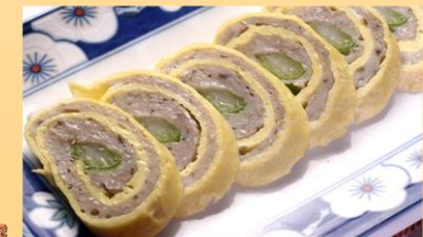
Fish & Egg Rolls

We can make reference to the recipe of "Fish & Egg Rolls" below and transform eggs to egg rolls. After adding with vegetables, this dish becomes not only healthful but also savoury